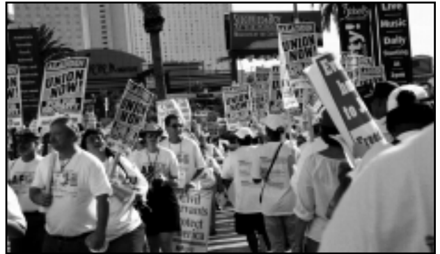
"AFGE conventioners, 1,200 strong rally to support Aladdin Hotel Culinary employees in Las Vegas in their fight to obtain union recognition."

on the Administration's great lie that the economy and public safety require a shrunken and deunionized Federal workforce.